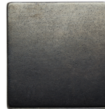
SILICON BRONZE DARK LUSTRE (BDL)