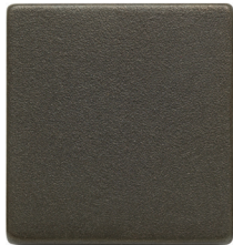
SILICON BRONZE DARK (BD)