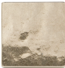
WHITE BRONZE LIGHT (WL)