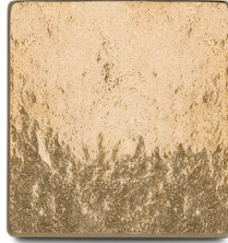
SILICON BRONZE LIGHT (BL)