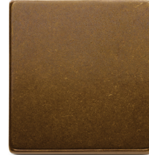
SILICON BRONZE MEDIUM (BM)