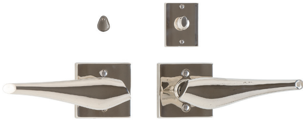
FUNCTION OASIS PRIVACY SET DIMENSIONS 2 1/2" X 2 1/2" PART NUMBER E10203 | E10203 WITH IP10200 HANDLE L10302 RALEIGH PATINA WHITE BRONZE HIGH POLISHED