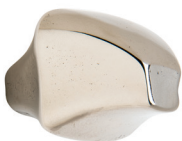
MADLINE CABINET KNOB CK10320 | 1 3/8" X 1" SHOWN IN WHITE BRONZE HIGH POLISHED