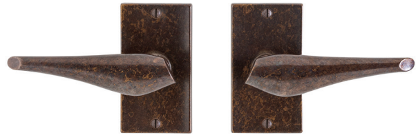
FUNCTION OASIS PASSAGE SET DIMENSIONS 2 1/2" X 4 1/2" PART NUMBER E10205 | E10205 HANDLE L10302 RALEIGH PATINA SILICON BRONZE RUST