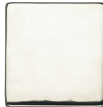
WHITE BRONZE HIGH POLISHED (WHP)