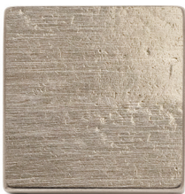
WHITE BRONZE BRUSHED (WBB)