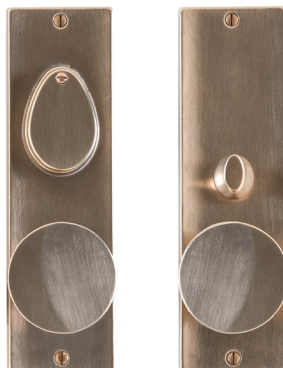
FUNCTION OASIS ENTRY MORTISE LOCK SET DIMENSIONS 2 1/2" X 8 1/2" PART NUMBER E10211 | E10209 HANDLE K10300 FLORA PATINA SILICON BRONZE BRUSHED