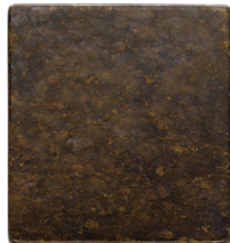
SILICON BRONZE RUST (BR)