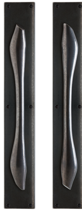
FUNCTION OASIS PUSH/PULL SET DIMENSIONS 3" X 20" PART NUMBER G10273 | G10273 HANDLE G10311 KENNET PATINA SILICON BRONZE DARK LUSTRE