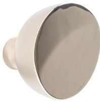
FLORA KNOB K10300 | \varnothing 2 3/8" SHOWN IN SILICON BRONZE HIGH POLISHED