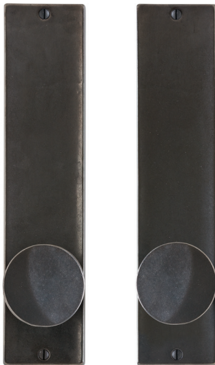
FUNCTION OASIS PASSAGE SET DIMENSIONS 2 1/2" X 11" PART NUMBER E10216 | E10216 HANDLE K10300 FLORA PATINA SILICON BRONZE DARK LUSTRE