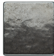
WHITE BRONZE DARK (WD)

Visit our website to learn more about our product offering, finish options and capabilities.