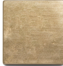
SILICON BRONZE BRUSHED (BBB)