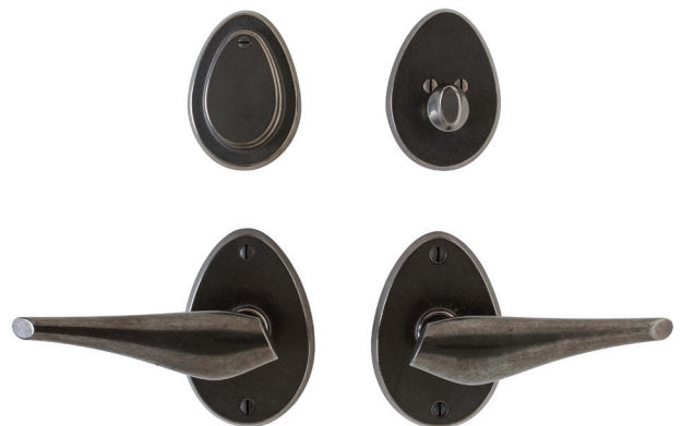
FUNCTION OASIS ENTRY DEAD BOLT / SPRING LATCH SET DIMENSIONS 3" X 4 1/4" PART NUMBER E10155 | E10155 WITH DB10150 HANDLE L10302 RALEIGH PATINA SILICON BRONZE DARK LUSTRE