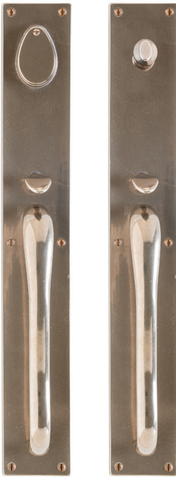
FUNCTION OASIS THUMBLATCH ENTRY DIMENSIONS 3" X 20" PART NUMBER G10275 | G10274 HANDLE G10305 PORTIA PATINA SILICON BRONZE LIGHT