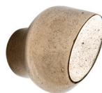
KENNET CABINET KNOB CK10322 | 15/16" X 1 1/16" SHOWN IN SILICON BRONZE LIGHT