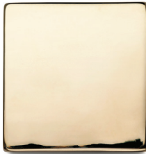
SILICON BRONZE HIGH POLISHED (BHP)

All products available in a choice of 12 finishes. *Upcharge applies to high polished finishes.