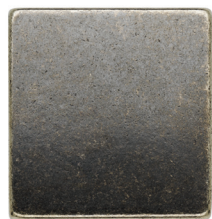
WHITE BRONZE MEDIUM (WM)